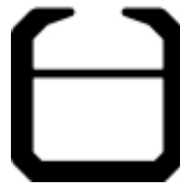
SMP-1B 1 x 1-in. 1/8-in. Sidewall