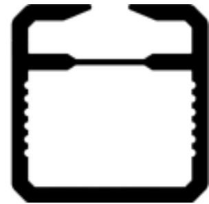
SMP-15B 1.5 x 1.5-in. 1/8-in. Sidewall

Tri Vantage Item #250097 JB Item #535000330 25-ft. Lengths, in Bundles of 6 126-lb. Shipping Weight